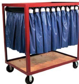
Table Skirt Cart